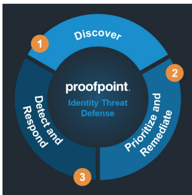
Figure 2: Proofpoint Identity Threat Defense platform.

Proofpoint research shows that 1 in 6 enterprise endpoints, both clients and servers, contain identity vulnerabilities. And this is even when traditional identity and access management (IAM) solutions are in place. Attackers exploit these vulnerabilities to gain access to admin privileges. When they first land on a host, that host is rarely their end target. They seek to move laterally within the network