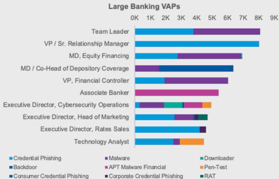
Figure 1: Breakdown of Very Attacked People at a leading Commercial Bank.

As threat actors seek new ways to infiltrate an FSI firm, it has made every person in your firm represent a different security level or compliance risk.